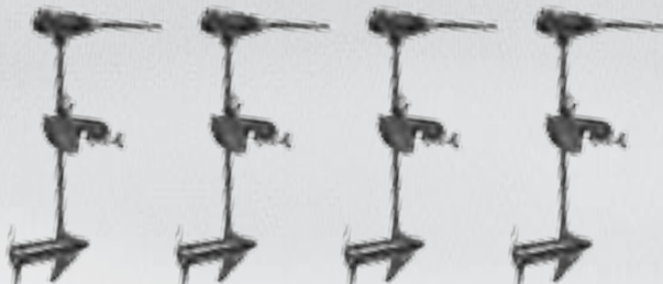
SS-32/28 32lbs of thrust SS-40/28 40lbs of thrust SS-46/30 46lbs of thrust SS-55/30 55lbs of thrust