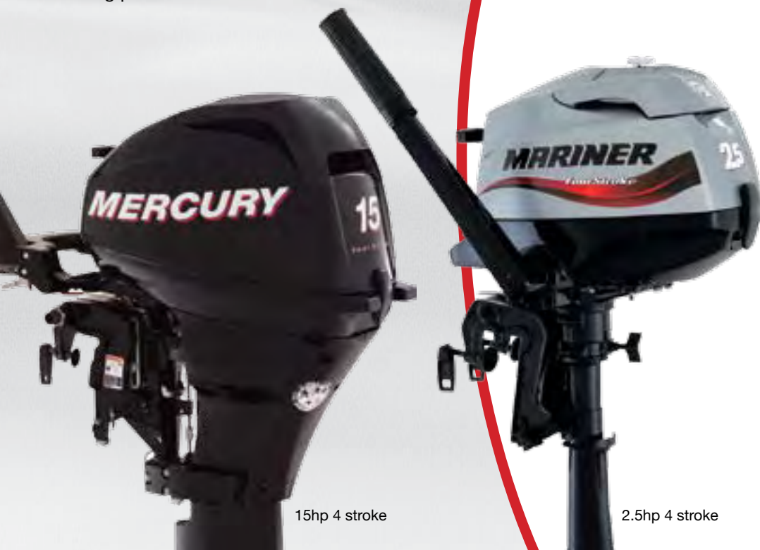
15hp 4 stroke

Mariner and Mercury four-strokes offer a greater boating pleasure than ever before.